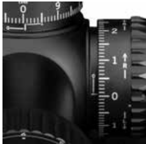
Aligning “0” marks.