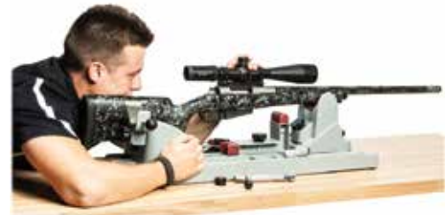
Visually boresighting a rifle.

After rifle is boresighted, do not re-tighten elevation zero stop lock screws on inner turret or replace the outer turret cap. This will be done after the final range sight-in is complete.