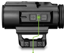
Power / Illumination Buttons

Press and hold the up (+) or down (-) button for three seconds to turn illumination off.